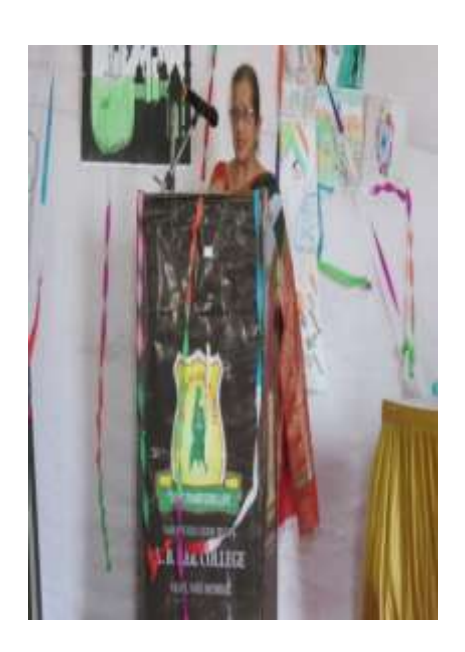
Speech by President of Sainath Education Trust